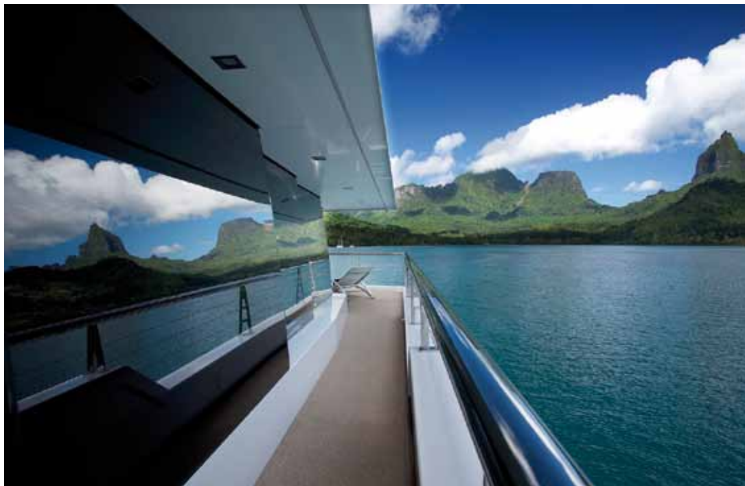
GONE FISHING Clockwise from left: The view aft along the port side, complete with granite decking; Spa and the shaded seating area on the flybridge; Looking aft from the Pod or Crow's Nest.