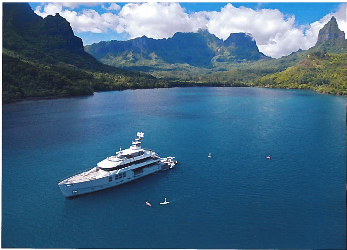
Above: Big Fish motor yacht at anchor in French Polynesia. Below: looking out over the Andaman Sea from one of the private villas at Naka Island.

➔ If these aren't so much new frontiers as new ways of travelling to edgier destinations, then MOZAMBIQUE belongs to the same trend, with safari parks developing to rival the country's now